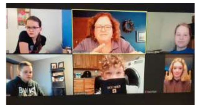
Jr Hi Youth Group/Confirmation Students with Pastor

1x/month (TBD) 9^{\text{th}}-12^{\text{th}} grades